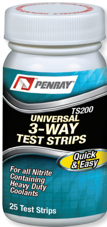
TS200 Test Strips

The first and only test strip designed for all heavy-duty coolant types. A quick and effective way to test your cooling system in both conventional and extended life coolant.